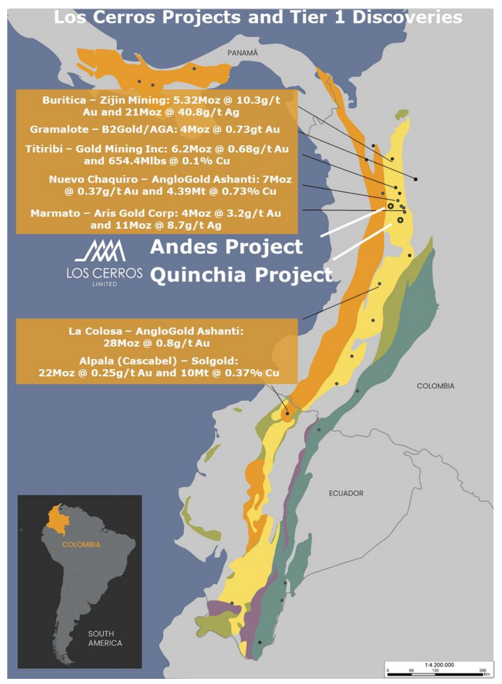
Figure 2: The Company's Andes and Quinchia Gold Projects sit on the Miocene aged, mid-Cauca Gold Belt in a sub-section of the belt that hosts many major copper-gold porphyry discoveries.

Los Cerros Limited is a gold/copper explorer with a dominant position within the Andes and Quinchia regions of the mid-Cauca Gold Belt of Colombia which hosts many major discoveries (Figure 2). The Quinchia Gold Project hosts a Resource of 2.6Moz<sup>1</sup> including the Miraflores Reserve of 457,000 Au ounces at 3.29g/t Au<sup>10</sup>. Within 3km of Miraflores is the Tesorito Gold Porphyry Resource plus the Chuscal and Ceibal porphyry prospects. Other targets within the Quinchia Gold Project include Inferred Resources at the Dosquebradas deposit.